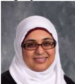
Huma Soomro Legacy Learning Center - Indianapolis