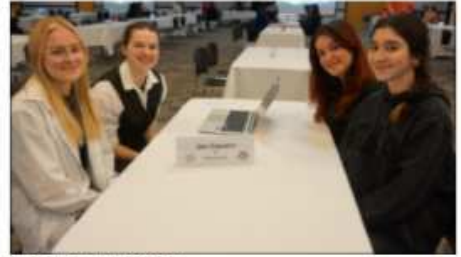
Indiana AWQ 2024 3rd Place - Jay County Jr.-Sr. High School Team 1