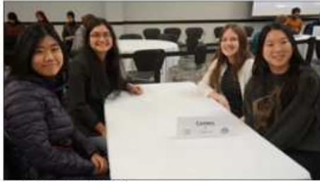
Indiana AWQ 2024 1st Place - Carmel High School Team 7 World Affairs Councils of America's National Competition - 4th Place - Good job!