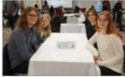
Indiana AWQ 2024 2nd Place - Carmel High School Team 2